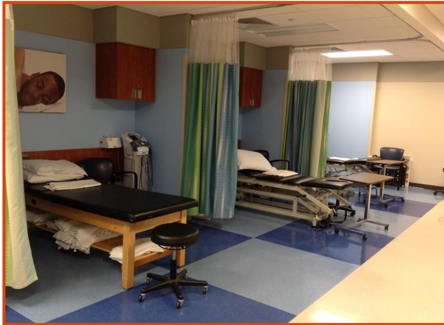
Private treatment areas and treatment rooms