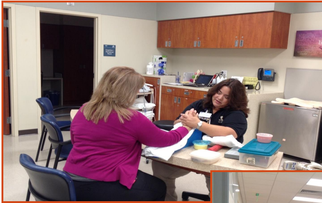
Outpatient therapy including certified hand therapy