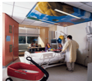
Three zone PFCC patient room

Advisory Council for more input. SBS is a national firm that has a specialty focus on facilities for children.